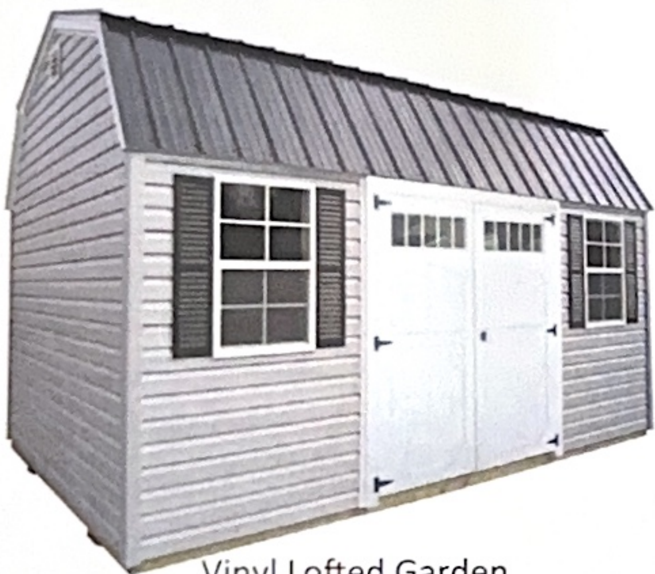
Vinyl Lofted Garden with shutters and transom windows