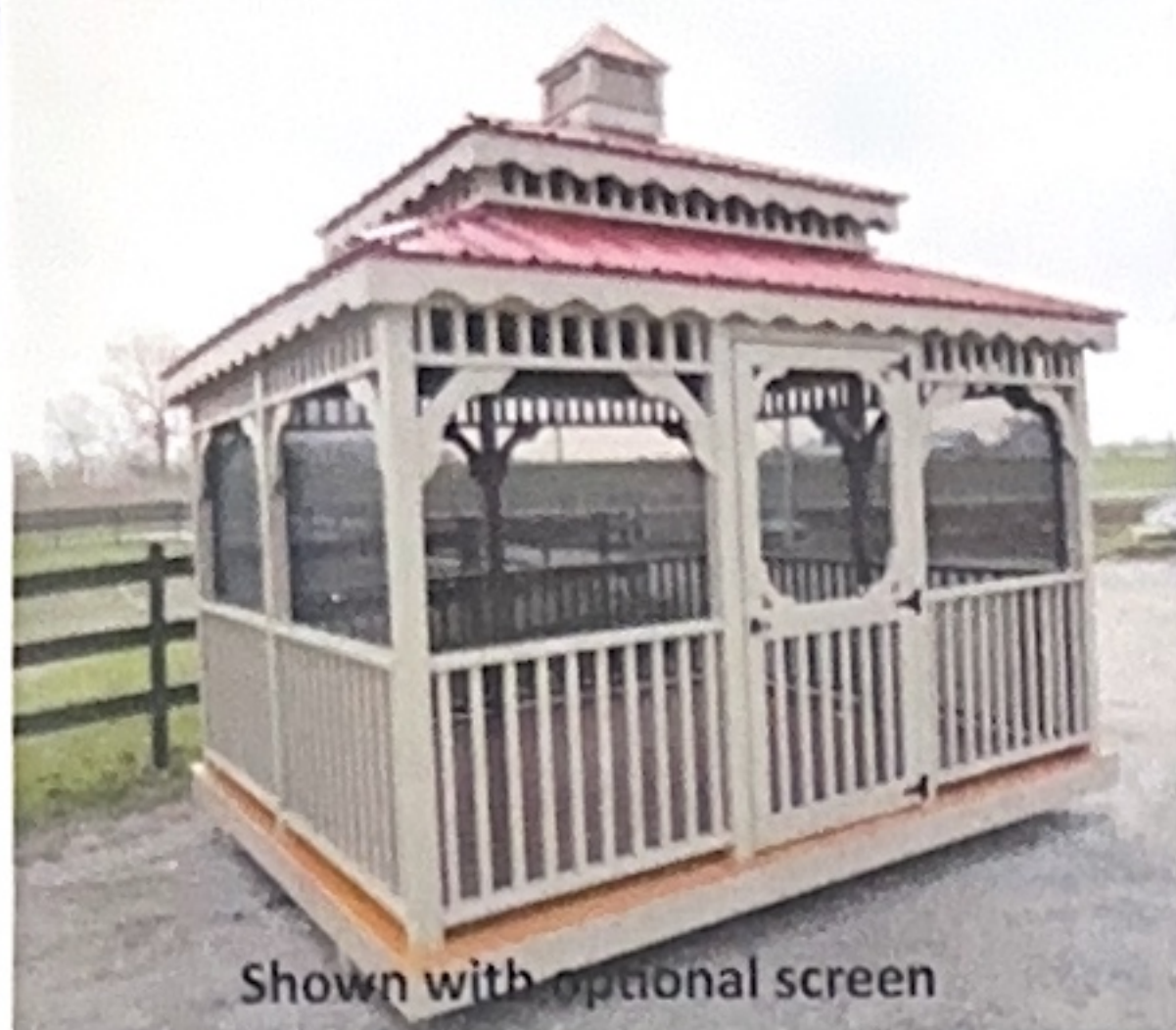
Shown with optional screen