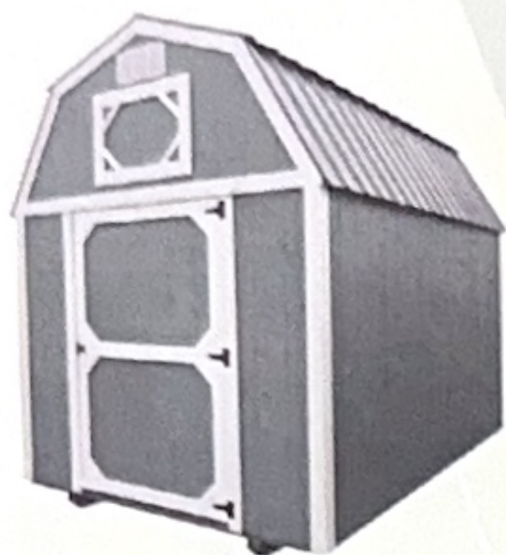
8ft wide with 46" single door.