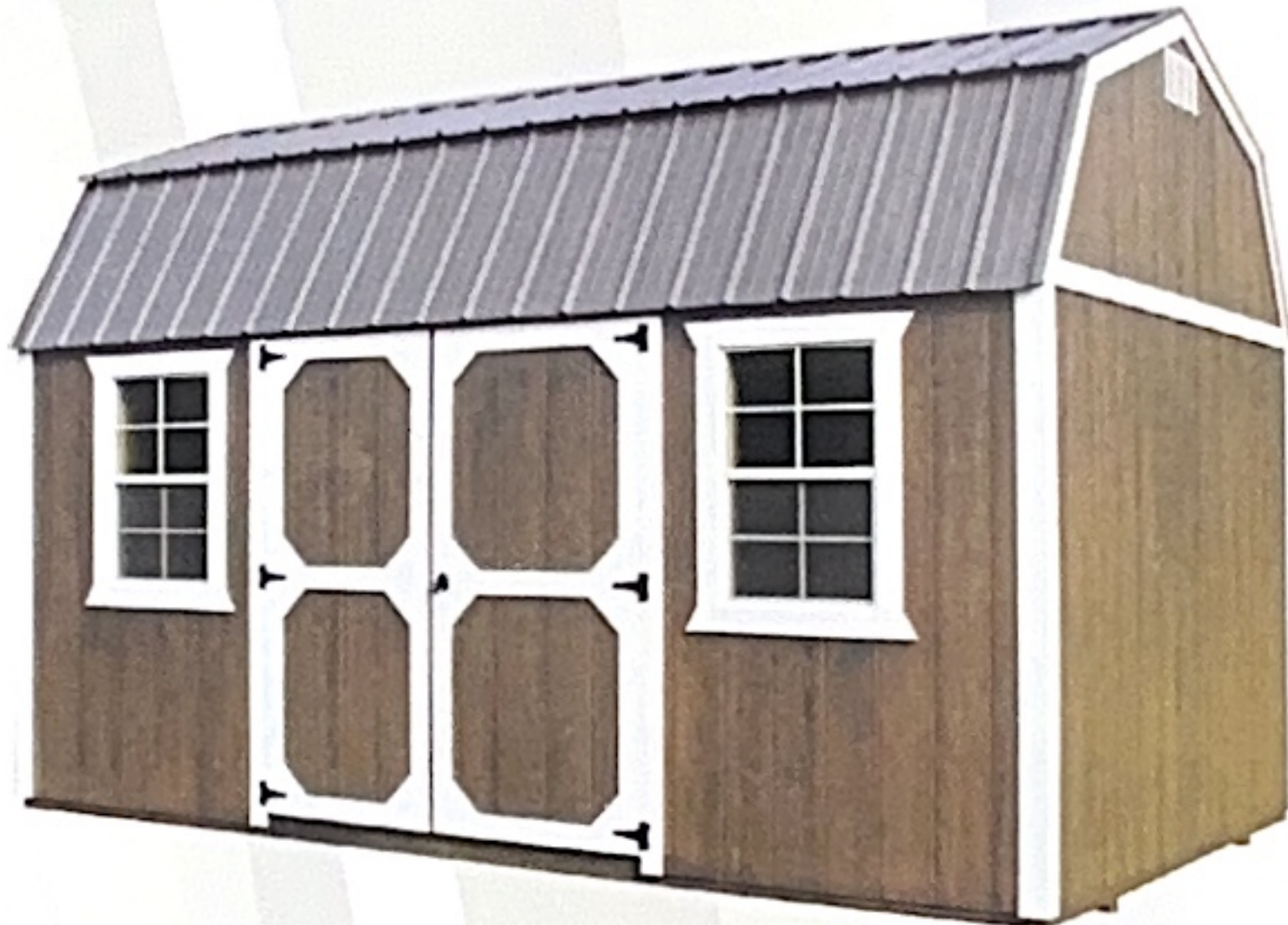
Painted Lofted Garden