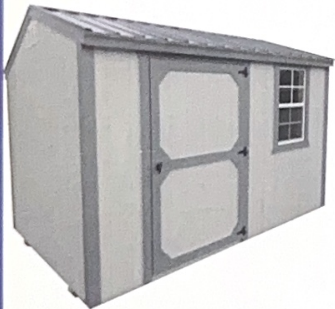
8ft wide with single door.