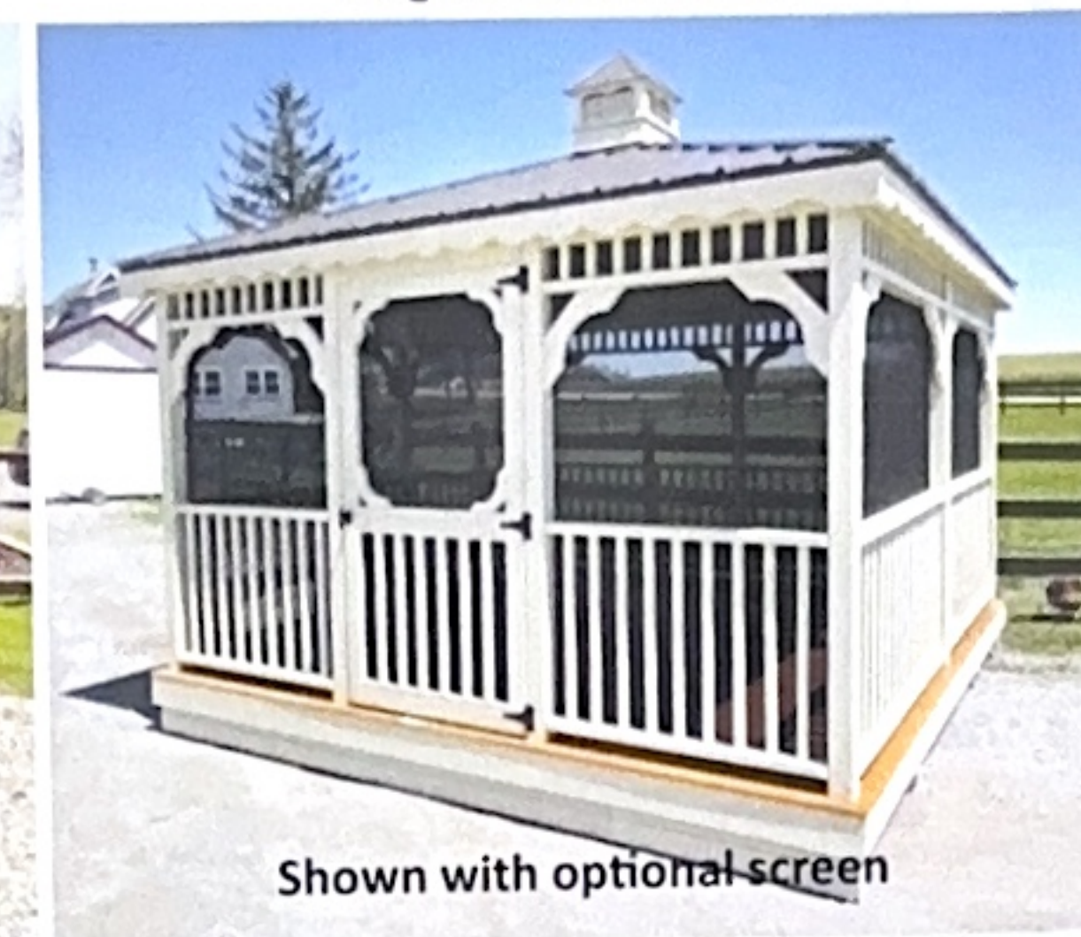
Shown with optional screen