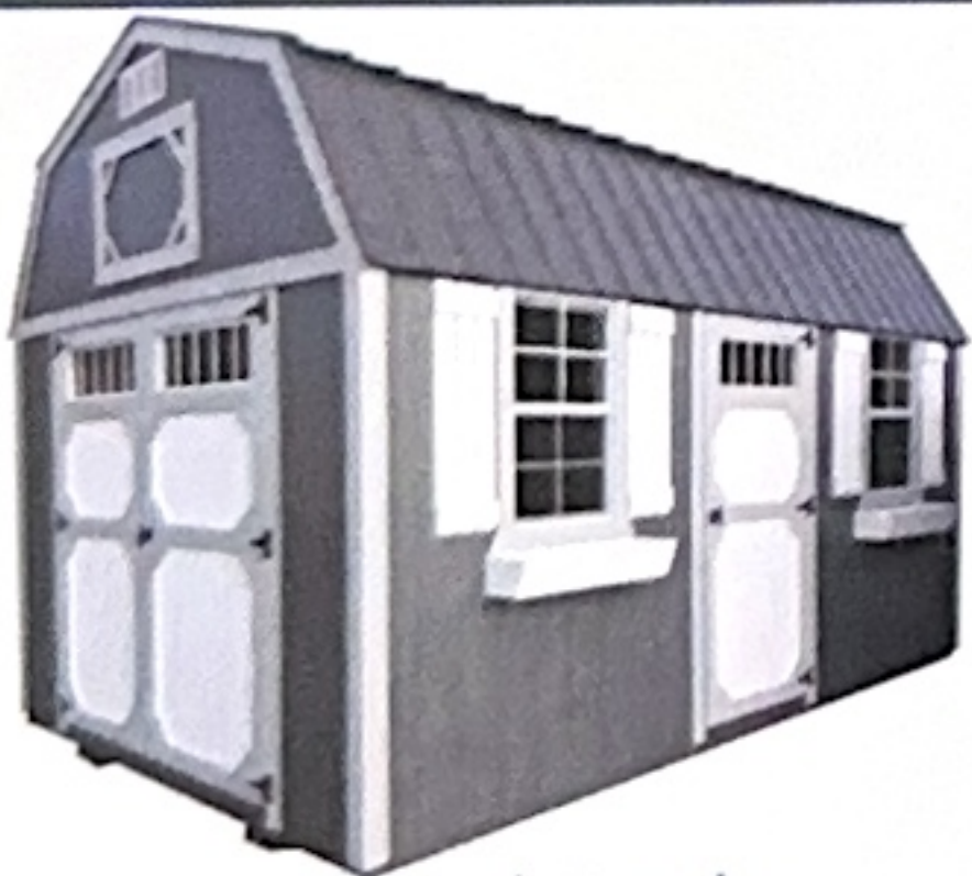
Deluxe Lofted Garden