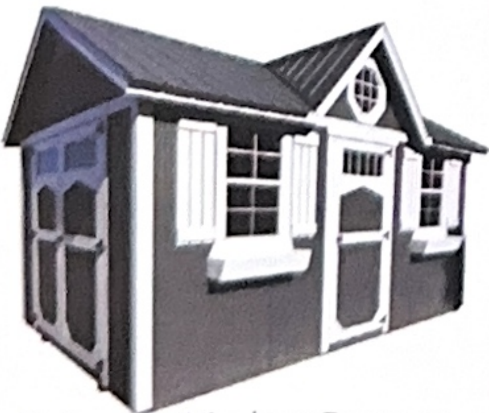
Octagon Window Dormer