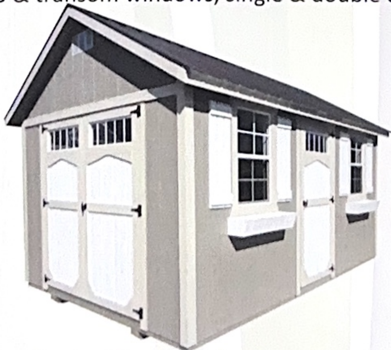
Deluxe Garden Shed with Roof Overhang

Add $1,000 for dormer with 3 transom windows.