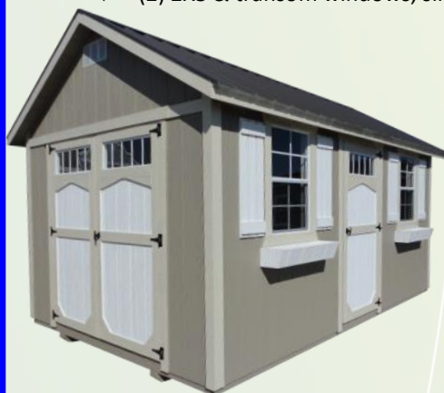
Deluxe Garden Shed With Roof Overhang