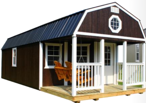
Add $700 for Deluxe Lofted Cabin. Includes 5ft swing and octagon loft window

6'6" Wall Height. Choice of 4ft or 6ft Porch.