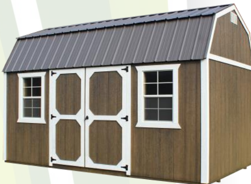
Painted Lofted Garden