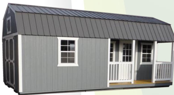
Gray Composite Deck