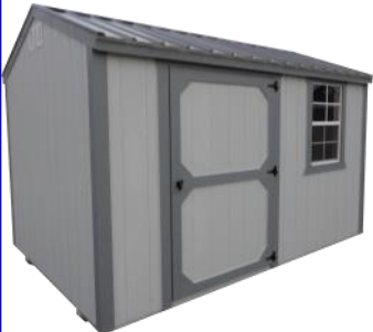
8ft wide with single door.