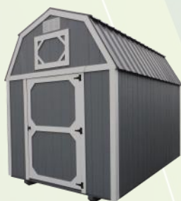
8ft wide with 46" single door.