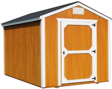
8ft wide with single door.