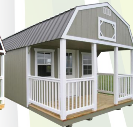
Standard Lofted Cabin