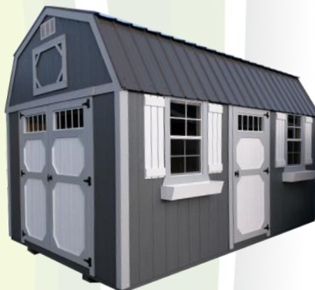
Deluxe Lofted Garden Shed