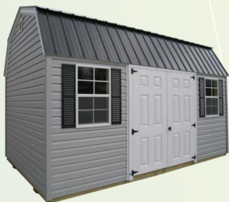
Vinyl Lofted Garden